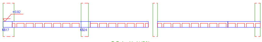
B-B kesiti (1/50)